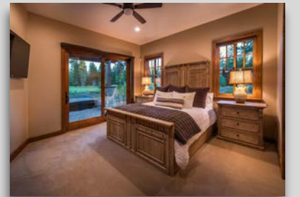
OLD GREENWOOD 3,500 SF