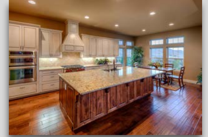
ARROWCREEK 3,900 SF