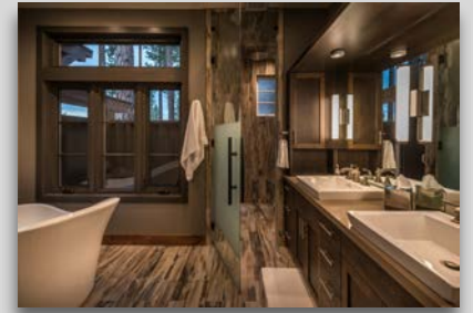
SCHAFFER'S MILL 3,500 SF