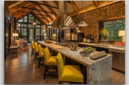
SCHAFFER'S MILL 3,200 SF (HGTV 2014 DREAM HOME)