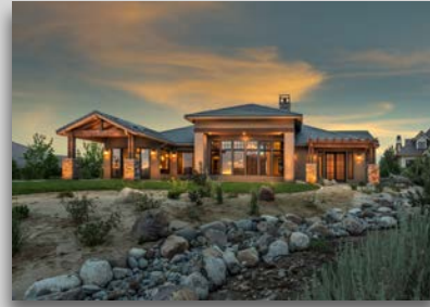
ARROWCREEK 3,700 SF