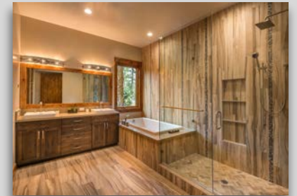
SCHAFFER'S MILL 3,800 SF