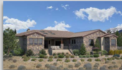
ARROWCREEK 4,400 SF