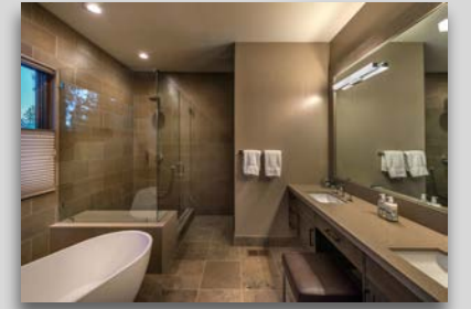
SCHAFFER'S MILL 4,200 SF