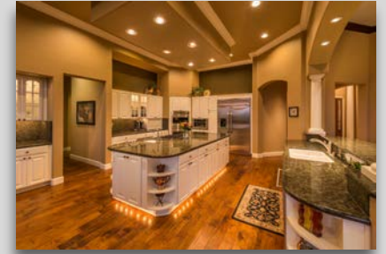
CAUGHLIN RANCH - 5,200 SF