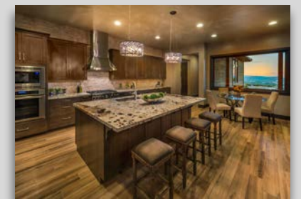
ARROWCREEK 4,400 SF