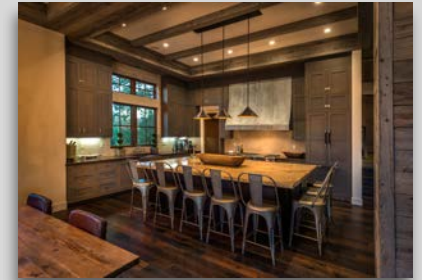
SCHAFFER'S MILL 3,800 SF