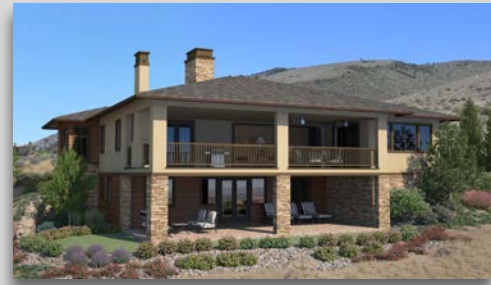
ARROWCREEK 4,000 SF